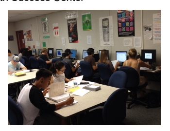
Computers for online assignments and activities