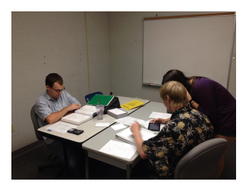
Study room for small groups with white boards