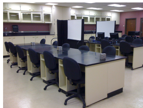
The STAR Center is funded by an HSI-Title V grant.