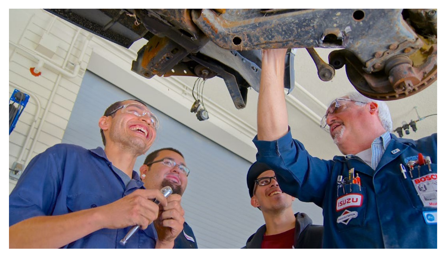
Rio Hondo Automotive Technology students with their instructor.