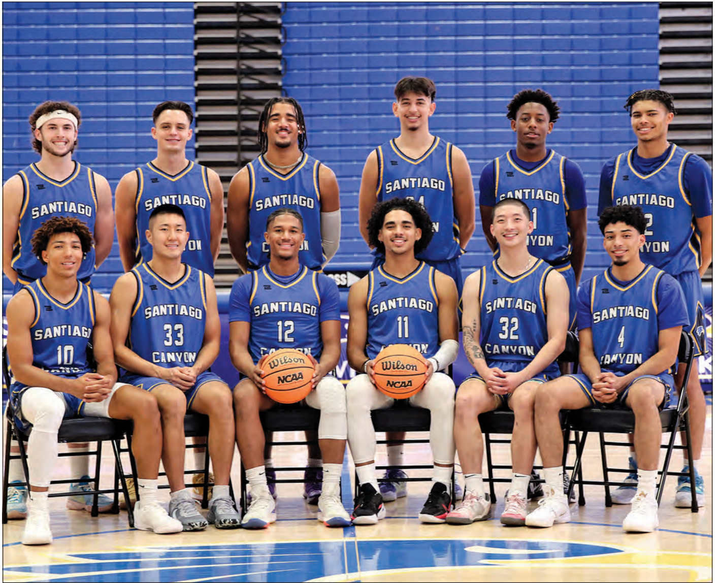
The 2024 Santiago Canyon College men's basketball team