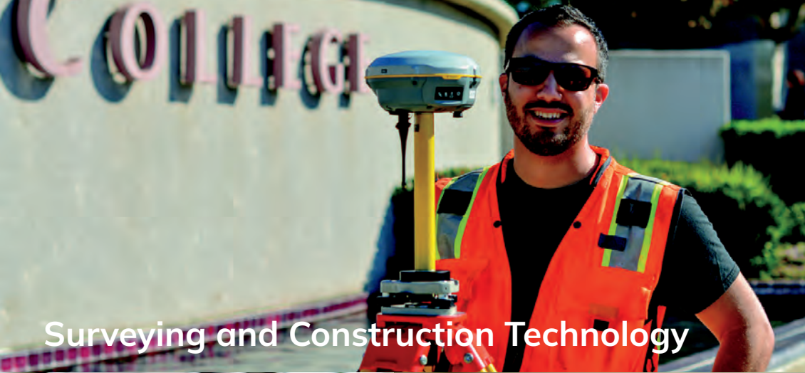
Surveying and Construction Technology