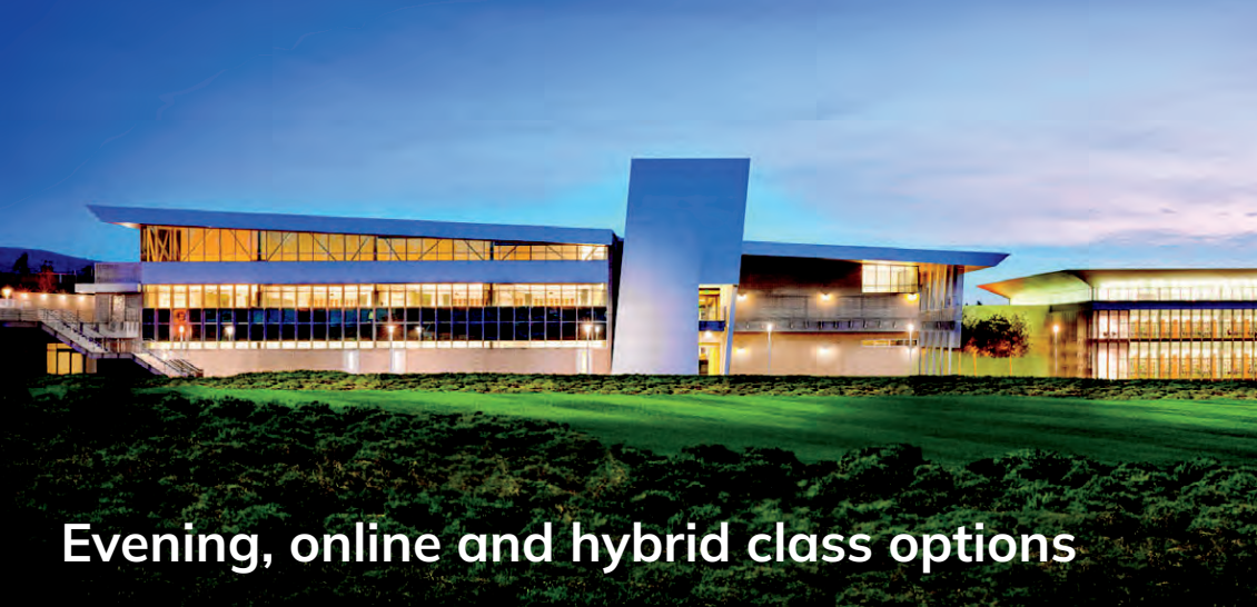
Evening, online and hybrid class options