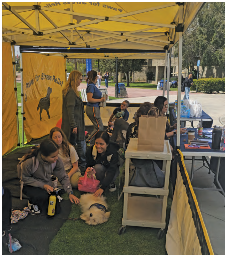
Students took advantage of the opportunity to relax and decompress during finals week.