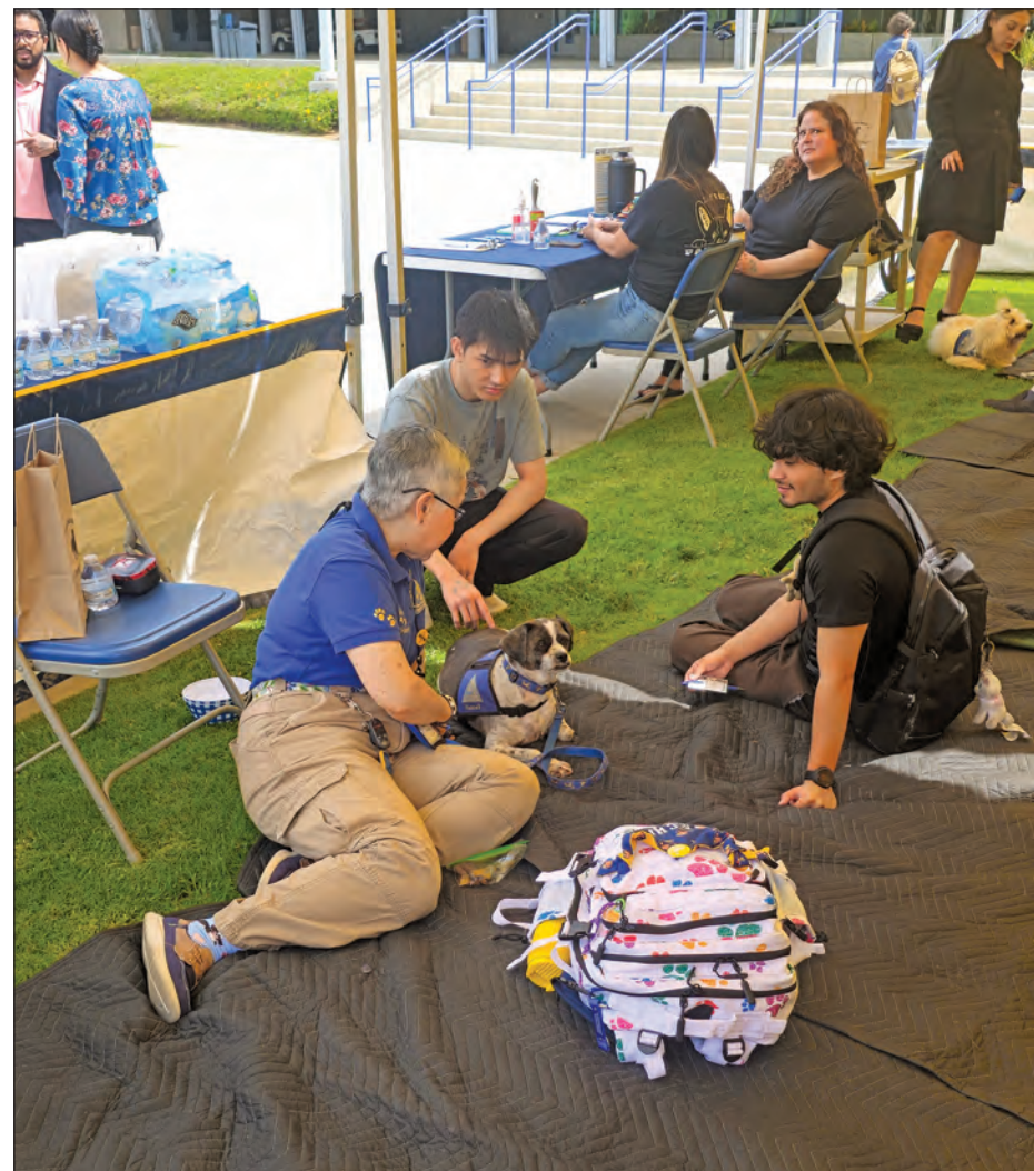
Santiago Canyon College students interact with a therapy dog during the Paws for Stress Relief event.